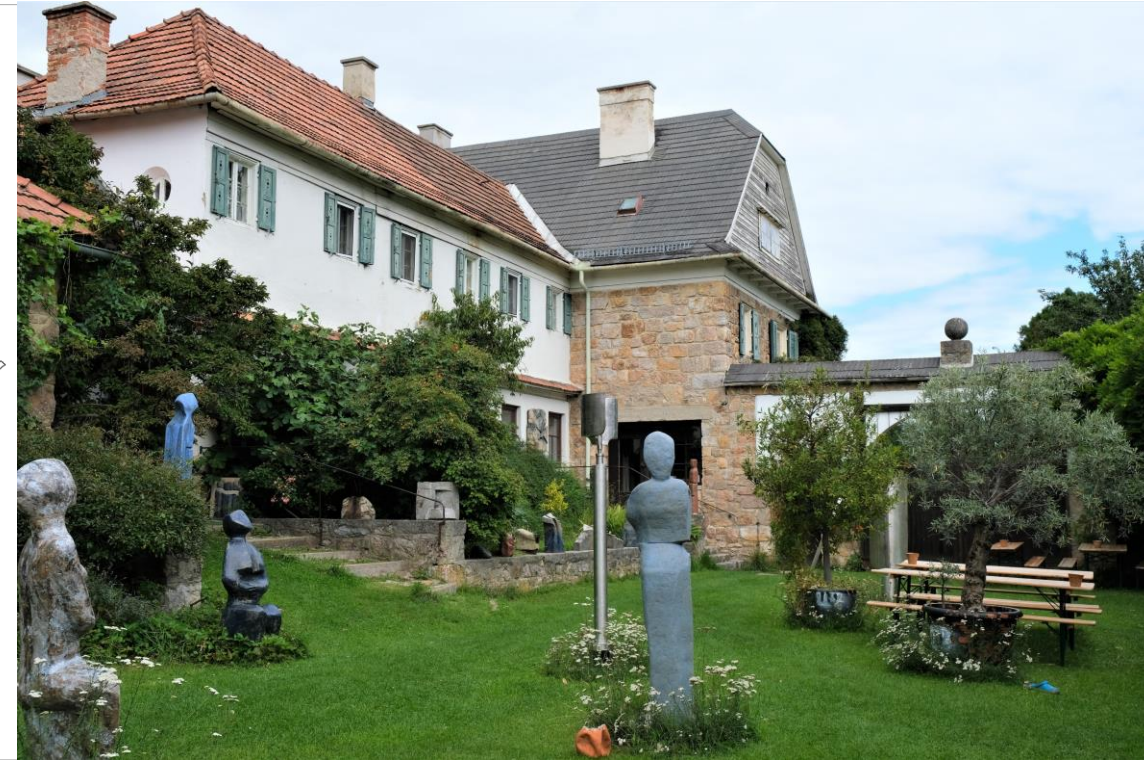
© Bundesanstalt für Agrarwirtschaft und Bergbauernfragen (2021)